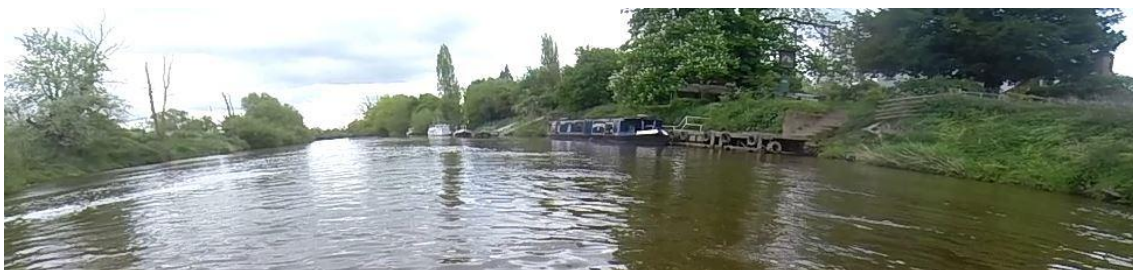
Turn 1 looking downstream (landing stage on right bank)