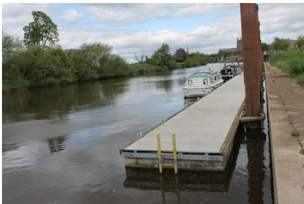
Start pontoon (facing upstream)