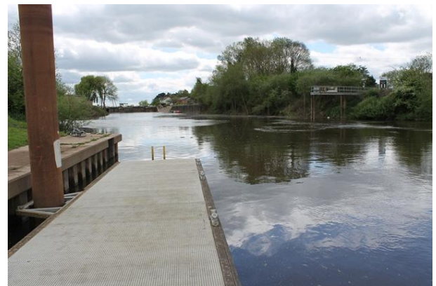
Start pontoon and turn 2 (facing downstream)