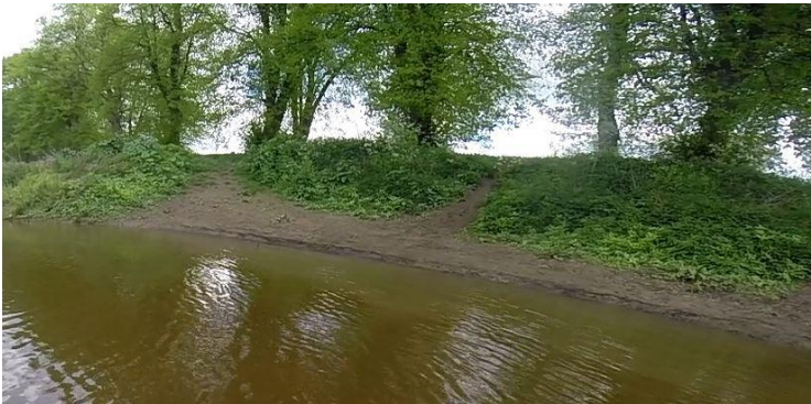
Portage get-out approach

The time trial will use the same portage as the Hasler event. It is a beach get-out, a short, flat run, and then a beach put-in. The portage is only traversed once during the race on the first upstream section.