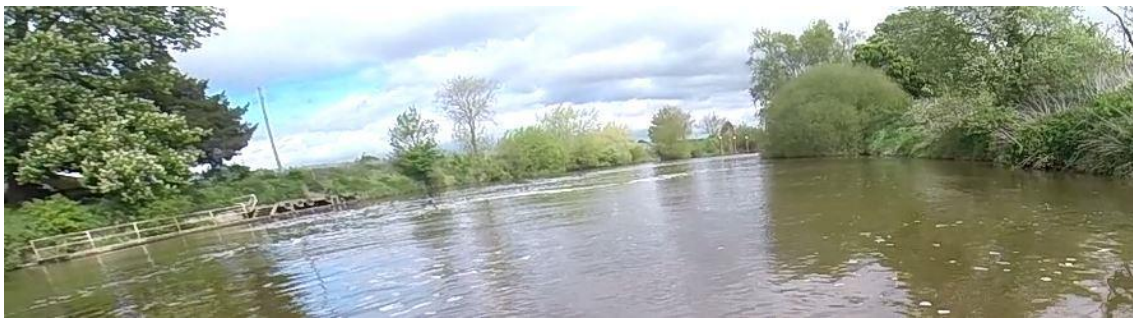
Turn 1 looking upstream (landing stage on left bank)